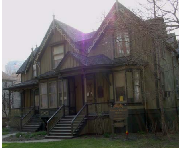
The new sign installed in front of the Willard House.