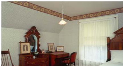
Photographs of Willard's Bedroom (above) and Den (below) by Leslie Schwartz, Leslie Schwartz Photography.

Finishes for the restoration were chosen based on the results of an on-site investigation and include a combination of custom and period appropriate finishes.