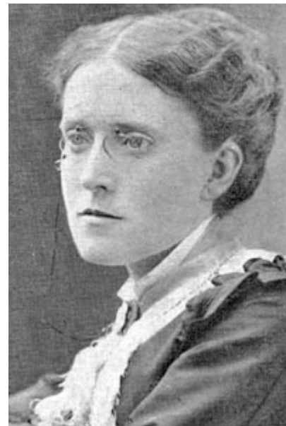
Portrait of a young Frances Willard.

In addition to her temperance and suffrage work, Willard was also interested in other family and humanitarian concerns. She wrote in her diary, “What can be done to make the world a wider place for women?” Through the WCTU, Willard carved an answer to her question. Adopting the policy, “Do Everything,” Frances allowed WCTU branches to move beyond temperance, should they choose to do so. For example, in 1889, the Chicago WCTU faction sponsored day nurseries, Sunday schools, an industrial school, a mission to house homeless women, and a low-cost restaurant. Clearly then, under her guidance, the WCTU transcended prohibition.